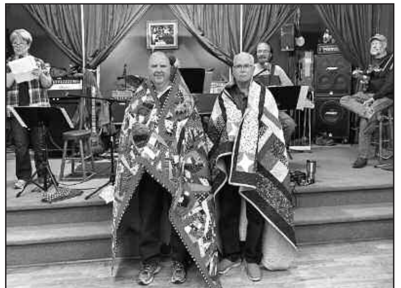
Florissant Grange community Quilt of Valor recipients.