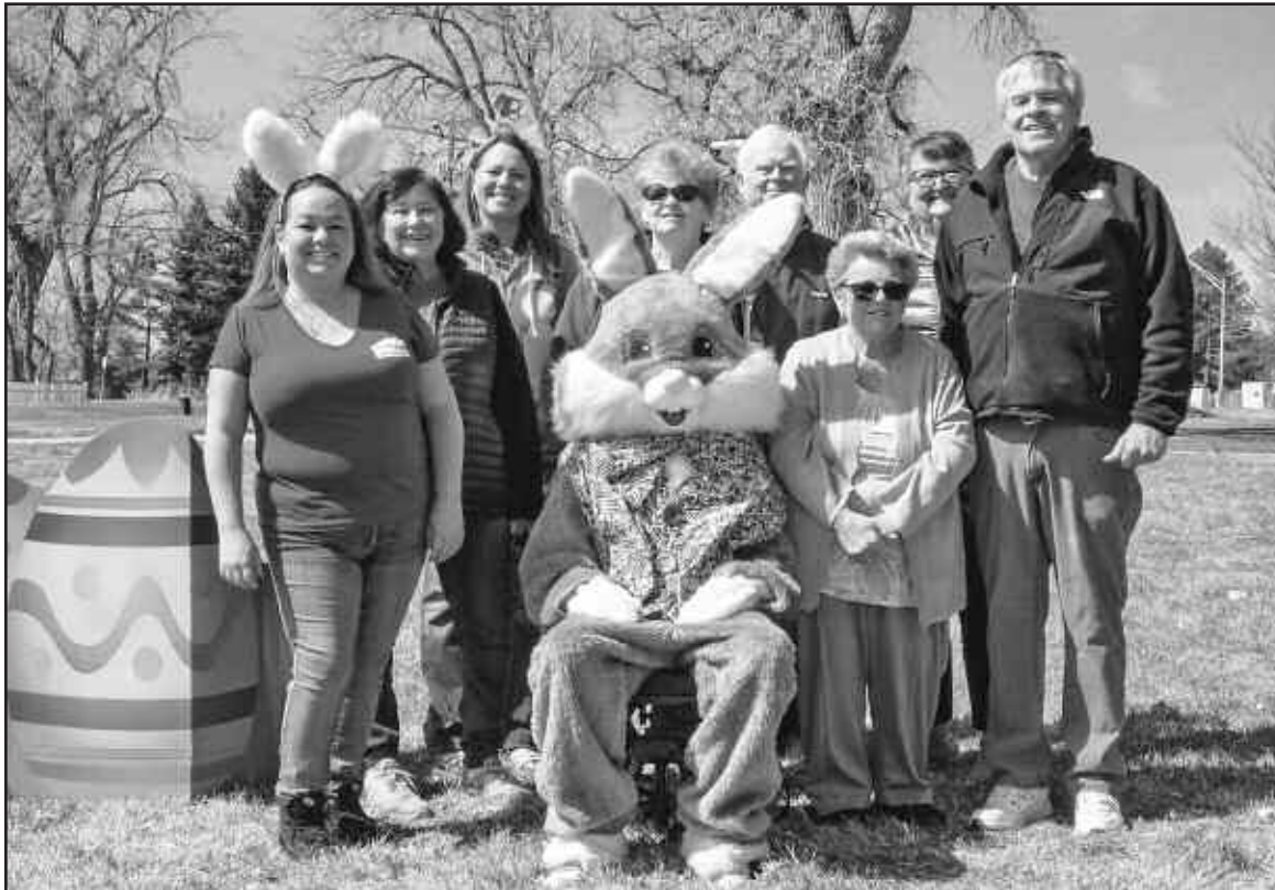
Enterprise Grange held their annual Easter Egg Hunt at Robby Ferruffino Park in conjunction with House2Home Real Estate. Several hundred Grangers and community members joined in the fun.

Mall-Original design and redesign project • Lakewood Planning Academy • Lakewood's Citizen's Emergency Response Team (CERT)