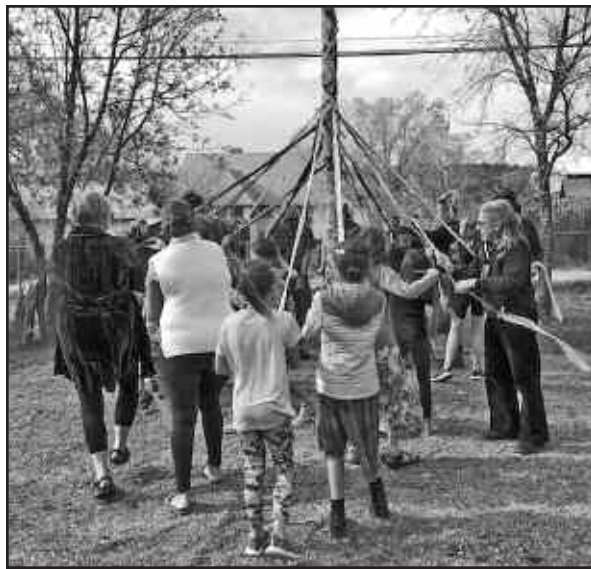
Festive and fun Maypole dance was a highlight.