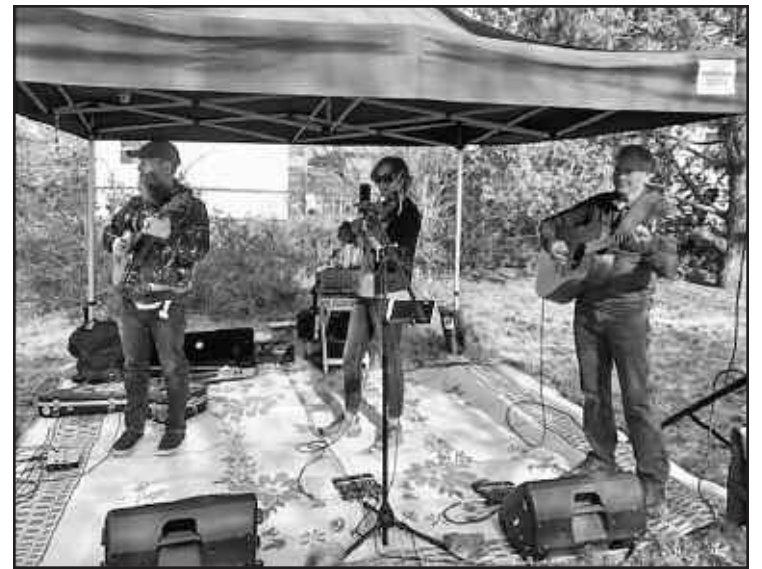
"Old timey" bluegrass music was the entertainment for the occasion.