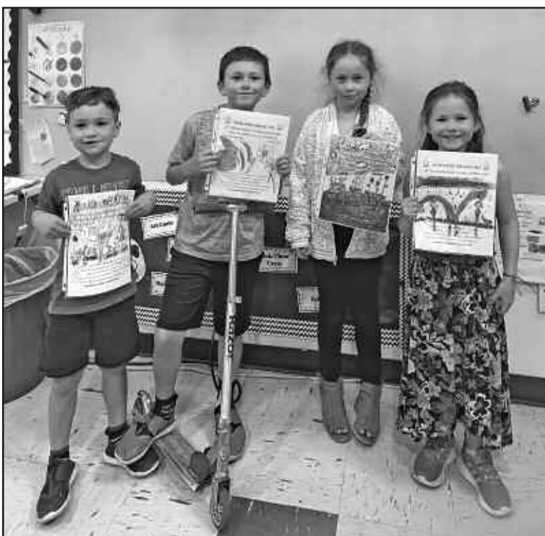
Sedalia Elementary Art Students colored posters for the Plant Sale.