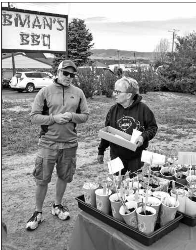
Plant Sale customers visiting while they pick out plants to take home.