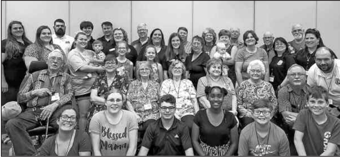
Great Plains Regional Conference 2022 attendees.