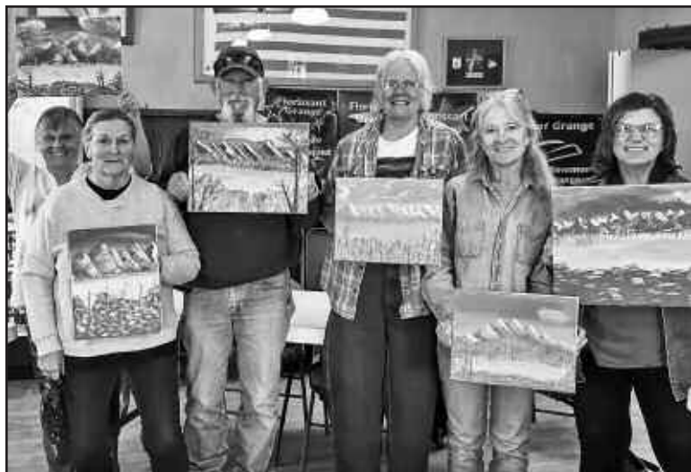
Paint With Me Class participants at Florissant Grange.

Isn’t summer in Colorado just the BEST?!!! Our Aspens are all decked (Continued on Page 7)