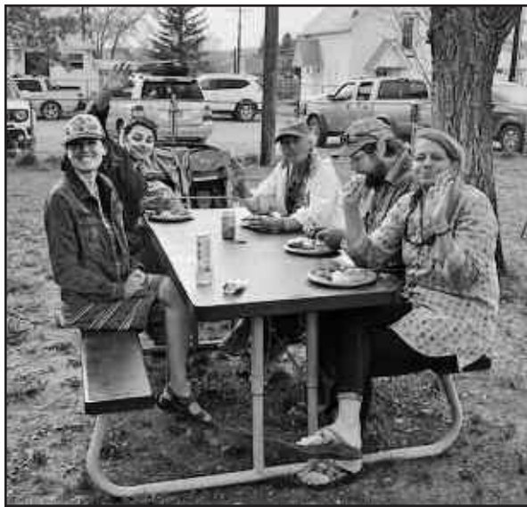
Mancos Bloom at Mt. Lookout Grange on May 1.