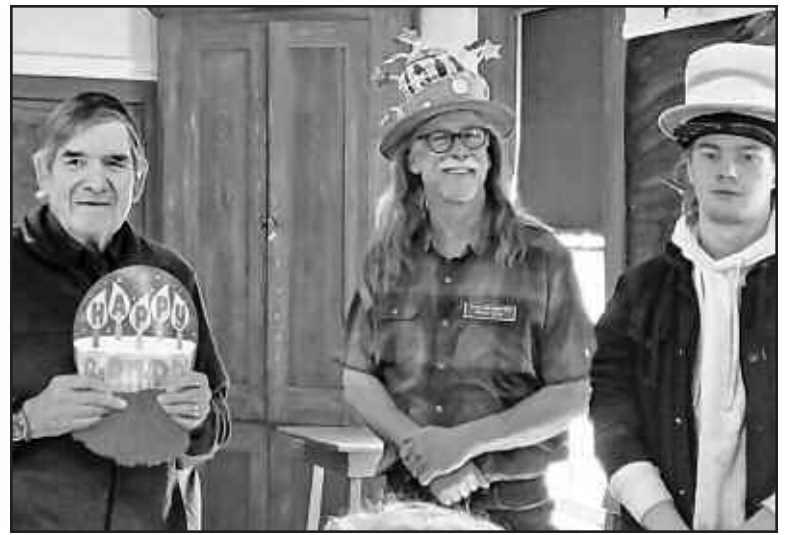
Birthday celebrations at Pleasant Park Grange.

Our Annual Rummage Sale will be held on August 12 and 13. Start cleaning out those closets! We would appreciate donation of your gently used items. Please be sure clothes are clean and not damaged. No tires, mattresses, televisions, computer equipment,