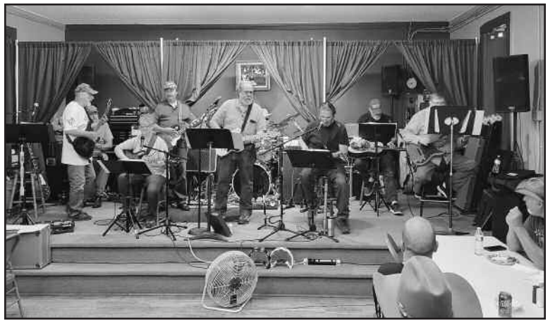
Band playing at Florissant Grange’s Thursday Potluck.