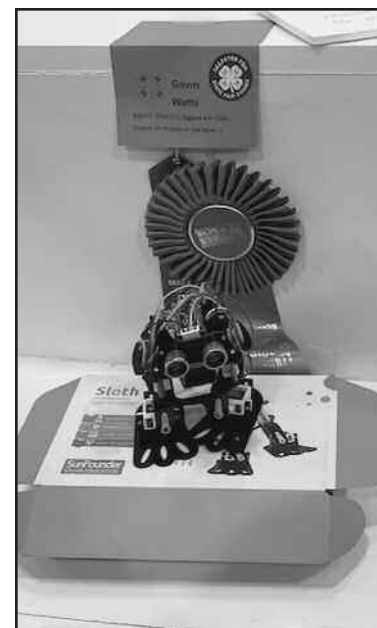
Gavin Grand Champion in unit robots on the move.