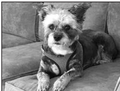
Felting Class — real dog and felted dog.