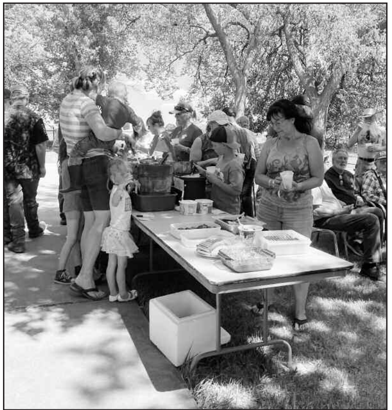
Marvel Grange hosted an Ice Cream Social honoring veterans in July.