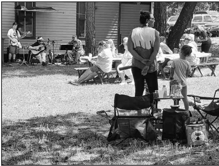
Perfect weather for the Pomona Picnic held at Pleasant Park Grange.