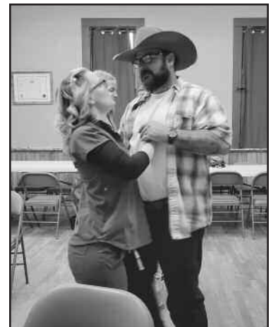
Grangers dancing to live music at the potluck.