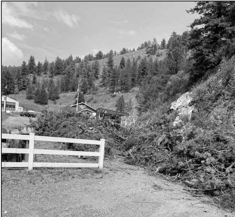
Slash collected at Golden Gate Grange.