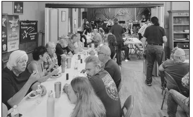
Thursday Potluck at Florissant Grange.