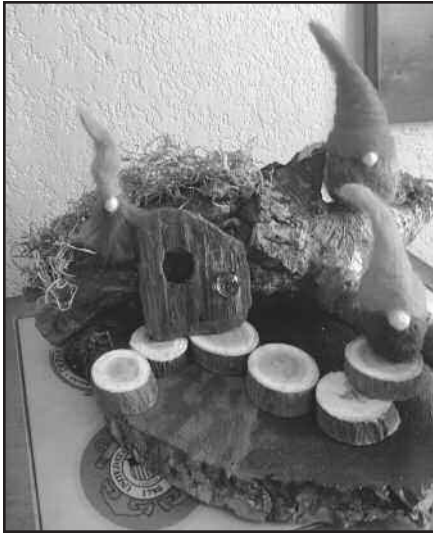
Felted Gnomes and Gnome House.

October 13 & 27 — Quilt of Valor Guild quilting time.