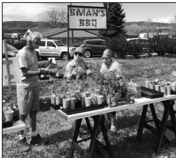
Heirloom Tomato and Plant Sale hosted by BMan's BBQ on Memorial Day weekend.