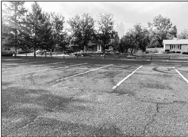
The surrounding photos show before, during and after parking lot repairs at Grandview Grange.