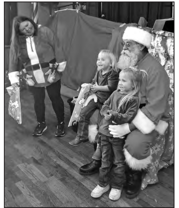
Children visiting with Santa at Florissant Grange.