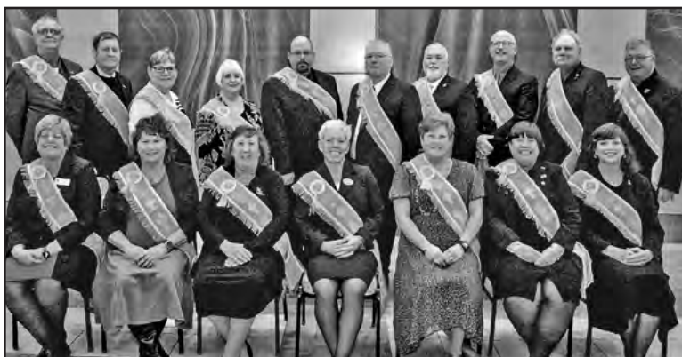
New National Officers