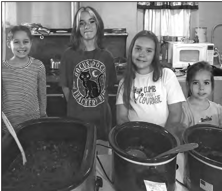
4-H Helpers at Enterprise Chili Dinner in October.