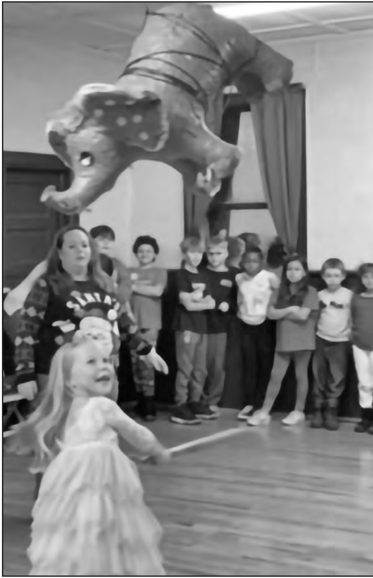
Darden Pomona Christmas party fun included an elephant piñata.

We held our Thanksgiving potluck at 6:30 p.m. on Wednesday, November 8. Carin' Clinic and Shannon's Hope clients were invited