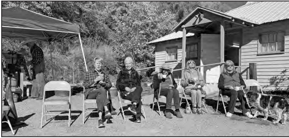
Animas Valley Grange provided glasses for viewing the solar eclipse.

In October we had our Luau. We had 57 in attendance with 11 dancers (Cortez, Marvel, and Durango groups) and eight in the Sleeping Ukes band. Thank you to everyone who helped with the food prep. Bills included extra plates and cups for upcoming events. Donations received were $254. Pork, chicken, rice with spam, plain rice, cabbage salad, fresh fruit, and desserts were served. We also served a pineapple punch, iced tea, and water.