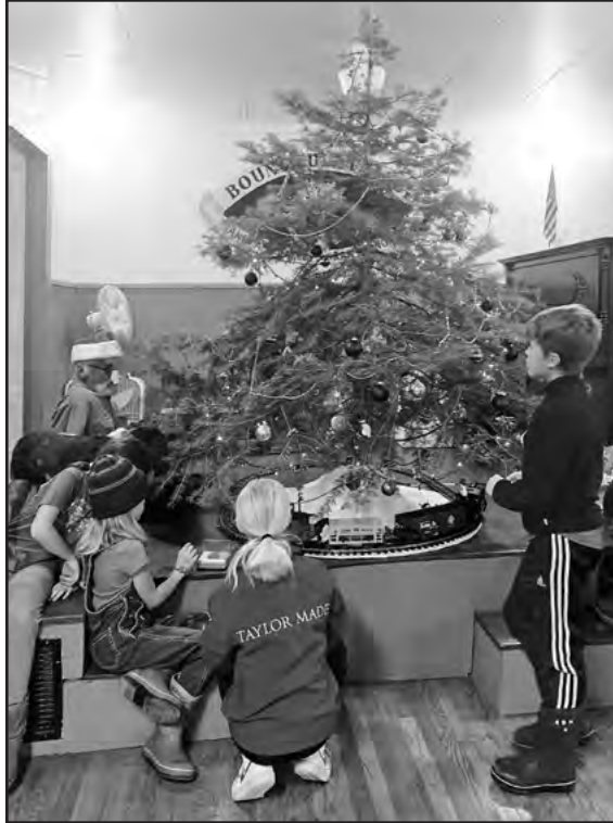
Children decorating the Grange Christmas tree.

The Lecturer is looking for volunteers for programs for some of the upcoming months and for ideas for a 150th celebration of the State Grange.