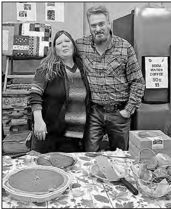
Florissant volunteers at free Thanksgiving dinner.