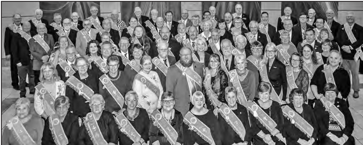
2023 National Delegates and Officers