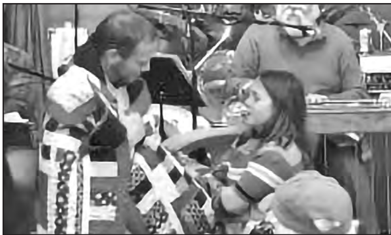
Quilt of Valor awarded at Florissant's Free Thanksgiving Dinner.