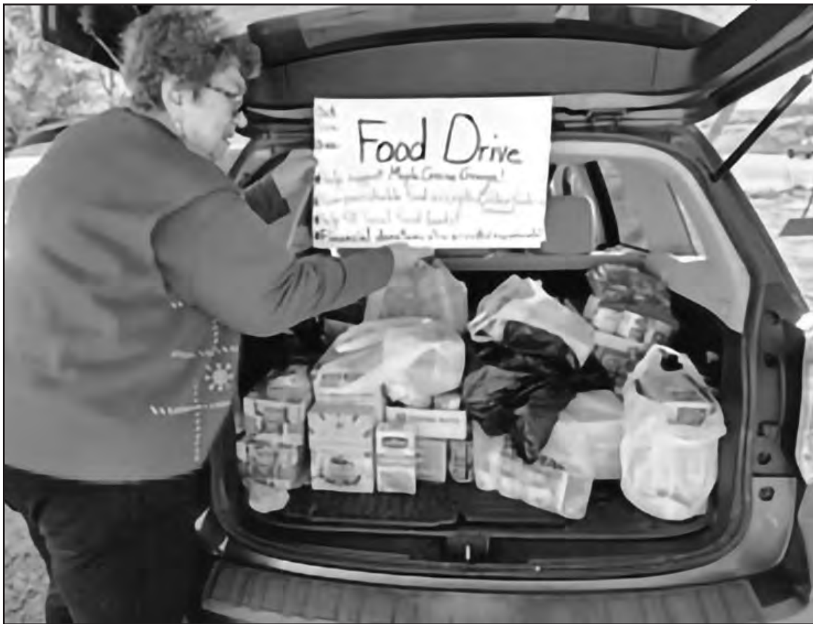
Maple Grove held a successful food drive in October and November.