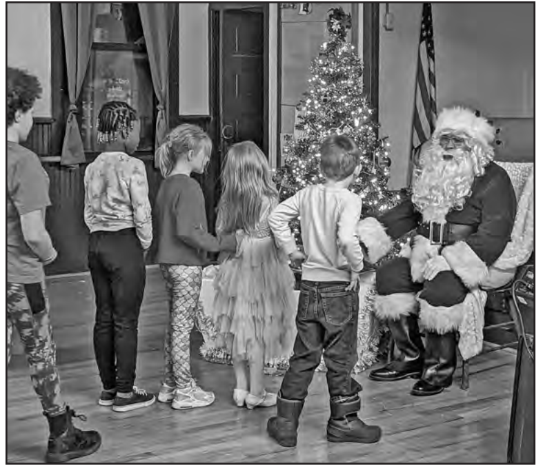
Children waiting to see Santa at Enterprise Grange.