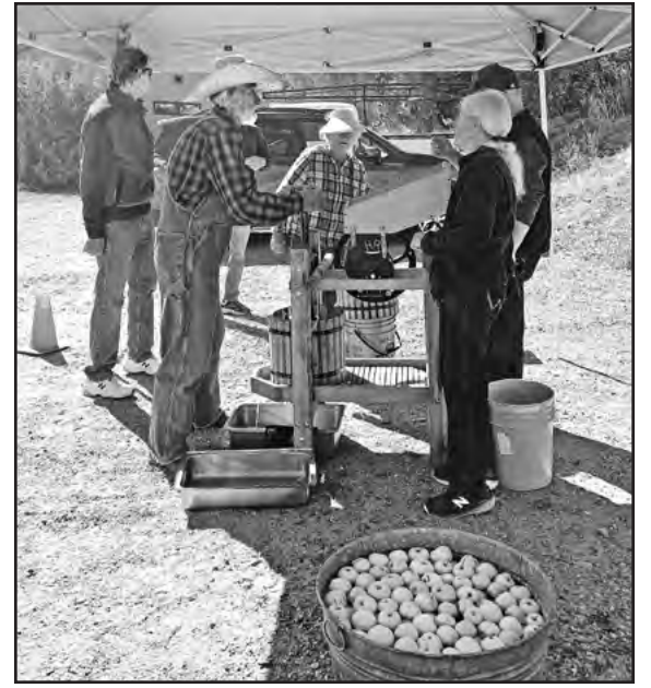
Pressing apples into cider at Animas Valley.