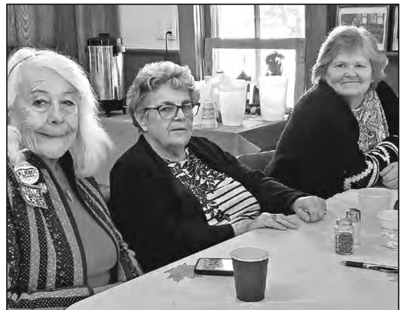
Guests at the Pleasant Park Thanksgiving dinner.