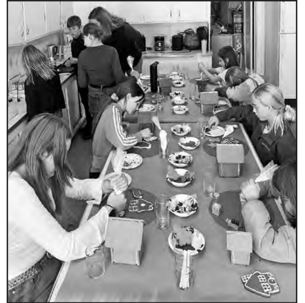
Gingerbread decorating at Animas Valley.