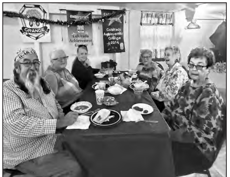
Enterprise Chili Dinner Attendees.