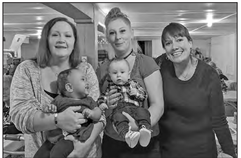
Shannon's Hope clients at Enterprise Christmas party.