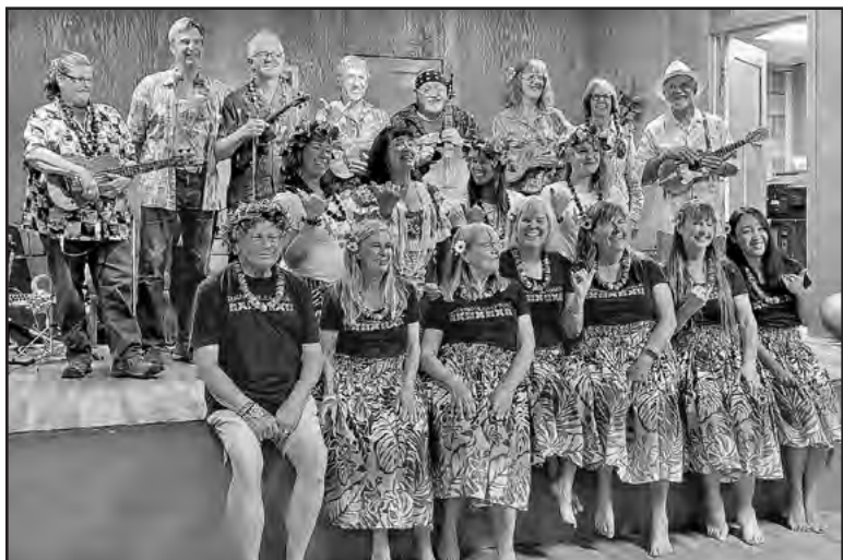
Highlights from the Luau at Marvel Grange in October.