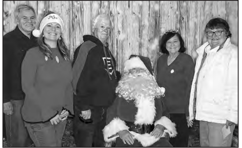
Santa Day at Enterprise Grange.